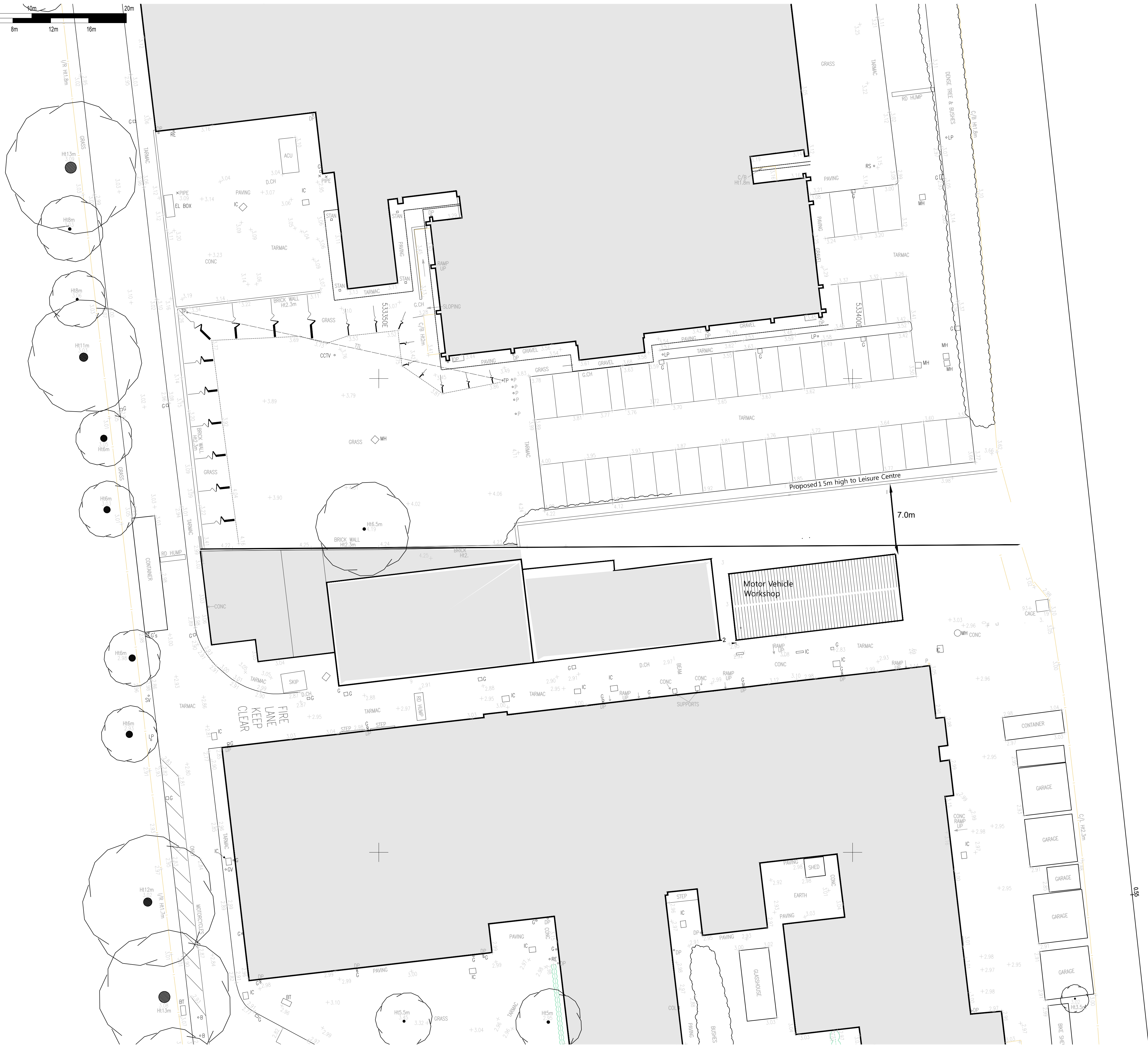
Proposed Site Layout Plan 1:200

Note: Do not scale. Only use figured dimensions. All discrepancies to be notified to this office.